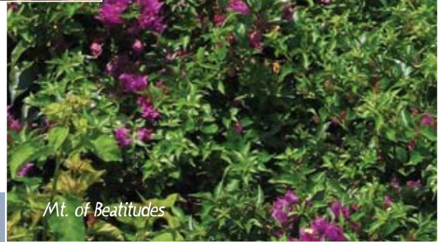
Mt. of Beatitudes