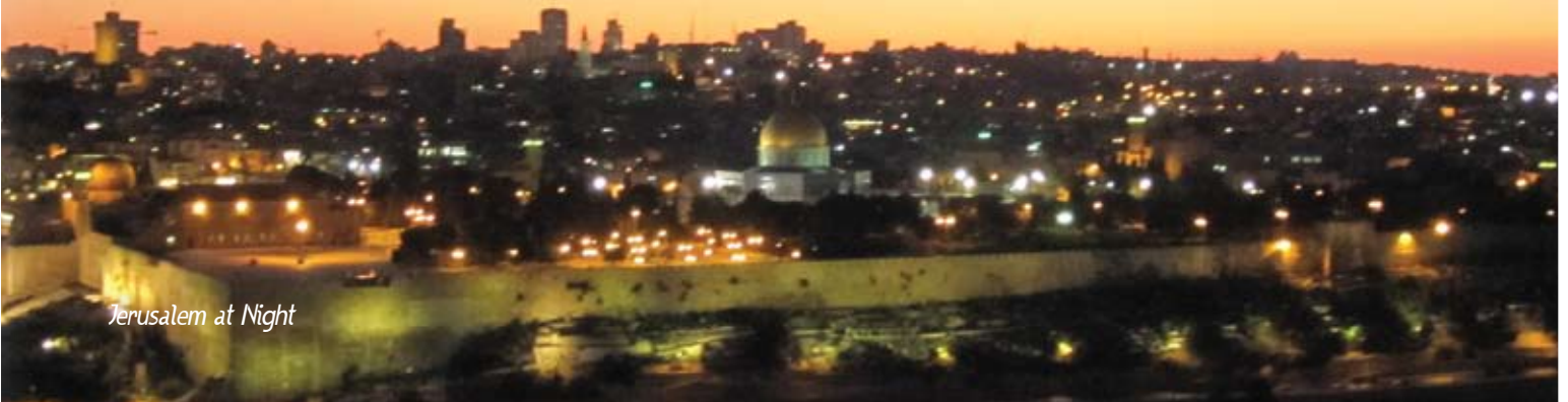
Jerusalem at Night

Descend to the City of David to explore the ancient water system: those who wish can wade through Hezekiah's Tunnel, pausing at the recently discovered Pool of Siloam. Proceed to the Western Wall plaza, to see Bar Mitzvah ceremonies. Walking through the Ophel (2 Chron. 33:14) excavations on the southern edge of Jerusalem's Temple Mount, we climb the Temple steps where Jesus and his disciples would have walked and taught. After lunch in the Old City's Jewish Quarter, we visit a Herodian mansion from the time of Jesus, recalling Peter's denials (Matthew 26). After dinner, view the beauty of Jerusalem on a night bus tour around the city.