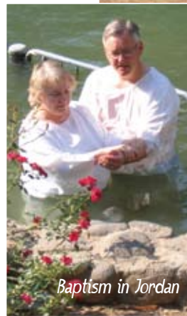
Baptism in Jordan