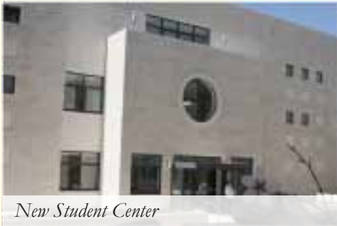
New Student Center

canteen area, lounge areas and various office spaces. If you or a small group would like to help, we would be delighted to recommend a specific area for you to focus on.