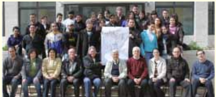
Students at Alpha Course